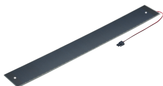
Solar panel with 2 mounting holes