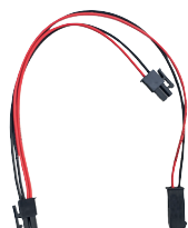
Y-cable, type B